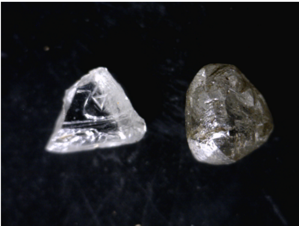
Diamonds recovered from the mini bulk sampling of V1 kimberlite pipe