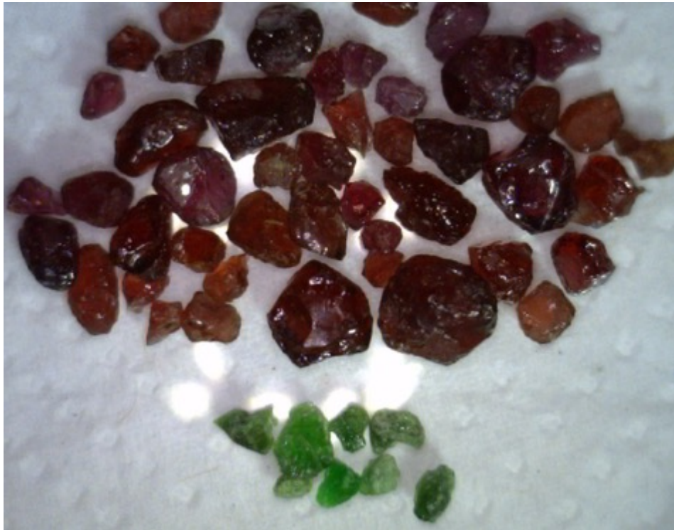
Dark red garnets and green Cr-diopsides recovered from mini-bulk sampling of V2 kimberlite